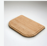
AC15 Bamboo Board