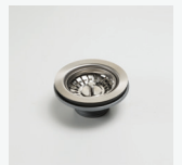
AC14 Basket Waste