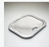
AC73 Utility Tray