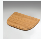
AC74 Bamboo Board