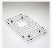
ACPSQ6 Bowl Protector