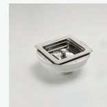
AC175Q Basket Waste