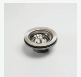
AC14 Basket Waste