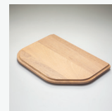
AC65 Bamboo Board