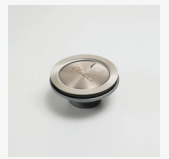
AC28 Basket Waste