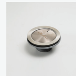
AC28 Basket Waste