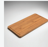
ACP124 Bamboo Board