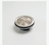
AC28 Basket Waste