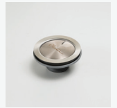
AC28 Basket Waste