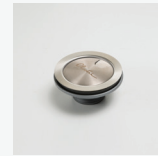
AC28 Basket Waste