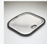
AC7320 Utility Tray